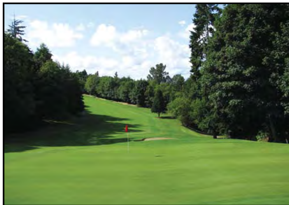
Twin Lakes Golf and Country Club in Federal Way is a challenging 18-hole layout.